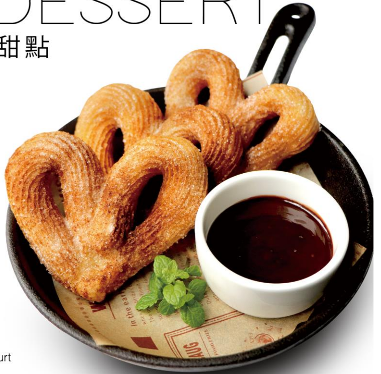
白蘭地櫻桃巧蘿絲 NT$180 Churros with Kirsch Chocolate Sauce