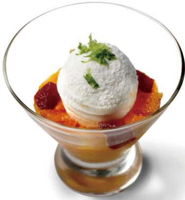
義式提拉米蘇 NT$180 Tiramisu